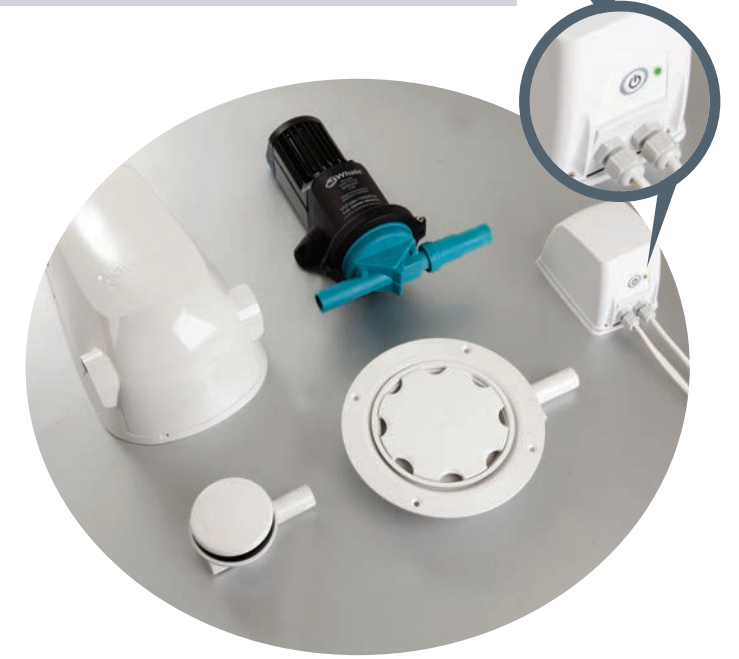
Whale Instant Match Kit SDP134T